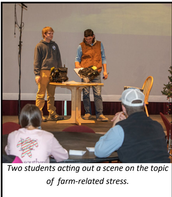
Two students acting out a scene on the topic of farm-related stress.

Dinner theater participants left 73 comments regarding take-home messages and additional positive feedback. The key messages reported by participants included the need to talk to others about stress, use coping skills, be there for others, and not be afraid to talk about this issue in the community. Additionally, participants indicated the need for Extension to host follow-up dinner theaters in neighboring communities and in their own communities during planting and harvesting season.