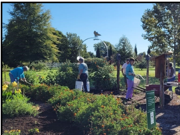
Extension Master Gardeners working in the Native Plant Garden.

Native plants used in the landscape benefit birds and pollinators. To demonstrate that native plants fit into any garden, the Extension Master Gardeners developed a 40 feet by 70 feet Native Plant Garden at the Western Kentucky Botanical Garden. To showcase the garden to the public, a native plant demonstration field day on “The Power of Native Plants: How to Add Them to Your Garden” was held in September.