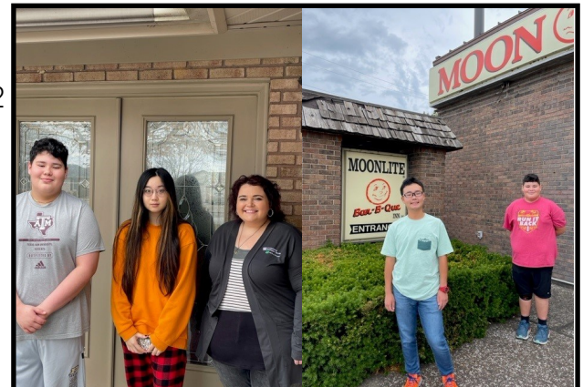
Both Exchange Program visitors with the 4-H'er from the host family.

The 4-H Exchange Program helps to enhance world understanding and global citizenship through high-quality 4-H international cultural immersion and exchange programs for 4-H youth. A high school senior from South Korea has spent the 2022-2023 school year attending Apollo High School. She says, “I really enjoyed the Homecoming dance. We don’t have anything like that in S. Korea. I was able to get dressed up, hang out with my friends and dance. I had a great time. I also liked going to a UK basketball game. The other people at the game were crazy for UK and the halftime show was awesome. I was able to take my host family to a Korean restaurant while we were in Lexington and show them some of the foods from my home country.” The host family benefits as well. They said, “The exchange program has been a wonderful opportunity for our family to learn about and appreciate different cultures.” This family also hosted a 14-year-old boy from Japan for three weeks in the summer of 2022.