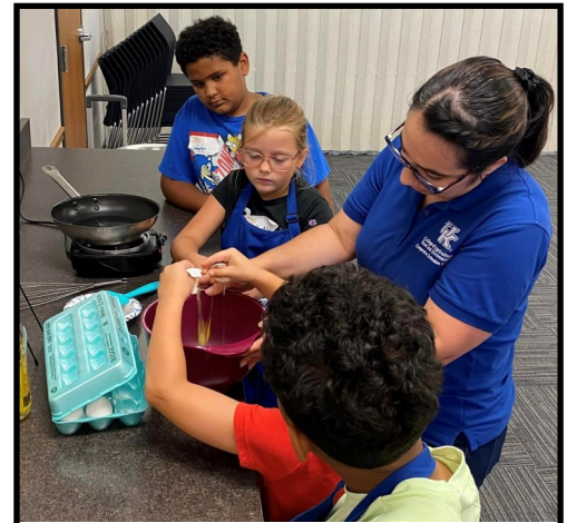
The 4-H Agent working with three participants on cracking eggs.

The Director of Programs at the Boys and Girls Club received a copy of the 4-H newsletter and asked if we could offer programming at the Boys and Girls Club facility, one of these being the NEP Super Star Chef Camp. The Daviess County 4-H Agent, FCS Agent, and All Areas Program Assistant worked together to put this program on. Eleven youth were transported to the Daviess County Extension Office to participate in a three-day camp. Prior to the NEP Super Star Chef Camp, 9% of youth reported the correct way of holding a knife, 9% reported the correct way to guide food when using a knife, 18% reported “chill” as the fourth step to keep food safe, and 55% reported the safe position for a pot handle while cooking on the stove. After the NEP Super Star Chef Camp, 70% of youth reported the correct way of holding a knife, 80% reported the correct way to guide food when using a knife, 70% reported “chill” as the fourth step to keep food safe, and 100% reported the safe position for a pot handle while cooking on the stove.