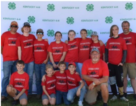
An Equal Opportunity Organization