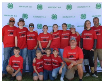
An Equal Opportunity Organization