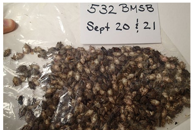
More than 500 stink bugs collected over two days from a home

Buildings in poor repair with many cracks and openings are most vulnerable to infestation. In such cases, stink bugs may enter by the thousands. Overwintering locations include crevices, walls, ceilings, and attics affording cool, dry refuge. Unheated attics are often the most crucial overwintering location inside buildings; crawlspaces and basements are much less preferred. Stink bugs also overwinter in garages, outbuildings, vehicles, HVAC units, gas grills, etc.