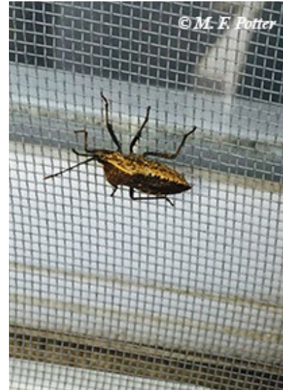
Attics are common entry points for stink bugs. Effective screening requires a mesh size no larger than 1/6-inch.

Traps. Pheromone-laced aggregation traps are being deployed for detection of BMSB and monitoring their levels in agriculture. Unfortunately, the same traps are ineffective at attracting stink bugs during their overwintering period within buildings. Similar to lady beetles, stink bugs are strongly attracted to ultraviolet light. Consequently, glue board-based light traps can be useful for harvesting these pests in areas such as attics. Homeowners can fashion their own stink bug trap by positioning a light above a large pan of soapy water.