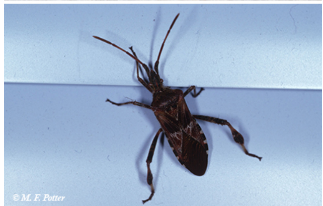
Boxelder bugs (top) and some leaf-footed bugs like the Western conifer seed bug (bottom) also enter buildings in the fall and are sometimes mistaken for stink bugs.

As noted earlier, BMSB attacks a wide variety of plants. They often feed by inserting their piercing mouthparts into fruits and seeds, damaging the marketability of many crops. Consequently, the pests are a serious threat to agriculture. BMSB also harm trees and shrubs in commercial nurseries and residential landscapes. Besides injuring berries, seeds, stems and foliage, the bugs may feed directly through the trunk, releasing sap, which attracts nuisance ants and wasps.