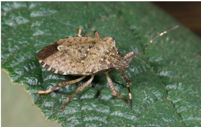
Adult brown marmorated stink bug. Note the light and dark banding on antennae, legs and abdomen

DESCRIPTION & HABITS. Stink bugs are related to bed bugs, but do not bite humans; their elongated, piercing mouthparts are used only to suck nutrients from plants. Their name comes from the pungent, cilantro-like odor produced by scent glands located on the mid-section of the body.