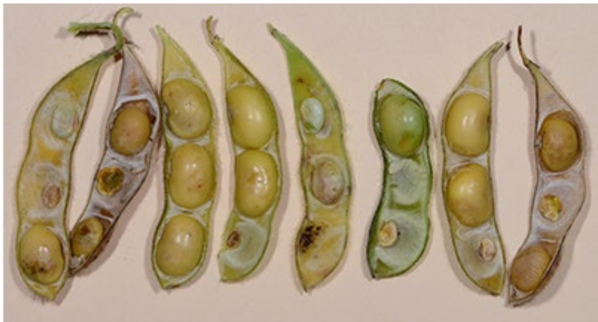
Stink bugs damage many crops, including apples and soybeans

Stink bugs lay their eggs outdoors on the underside of host plant leaves. The newly emerged nymphs are reddish and black in color, becoming brown as they mature. The telltale white and dark banding on legs and antennae of adults is also apparent on the nymphs. Average development time from egg to adult is about 30-45 days. One to two generations per year occur in northern and Midwestern states, while additional generations are possible further south. BMSB adults are quite mobile. They readily fly from one landscape to another and between agricultural, urban and forested areas in search of preferred host plants. These environments also afford overwintering habitat crucial for their survival.